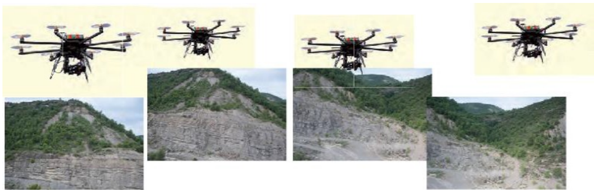
Figure 2: Aerial acquisition by Lidar embarked on a drone